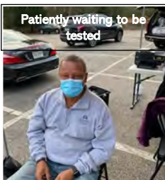
Patiently waiting to be tested

and just showed up without an appointment. Nevertheless, "Better To Know" didn't want to turn anyone away. Good thing they didn't because this event resulted in a staggering 70 "positive" results, which is almost 25% of those tested. These were 70 people who were able to make an informed decision about how to celebrate Thanksgiving and avoid putting others at risk. The overwhelming participation, which was four times the expected number, may have been a contributing factor in some lab results taking longer than the expected 48-72 hours turnaround.