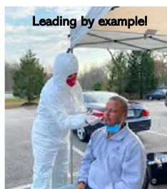
Leading by example