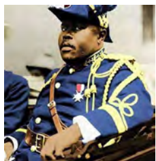
Marcus Mosiah Garvey was born

August 17, 1887, in St. Ann's Bay, Jamaica. He was a charismatic black leader who organized the first im-