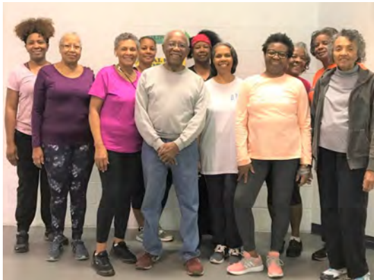
Pictured above from left to right: