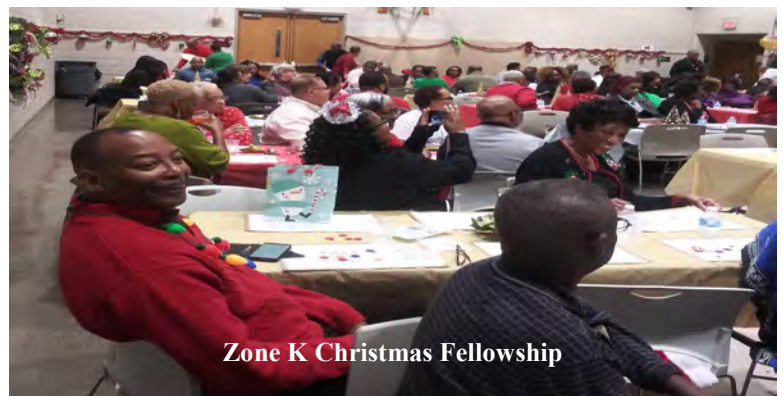
Zone K Christmas Fellowship

For additional Activities and Events: http://bit.ly/FMZ_Calendar