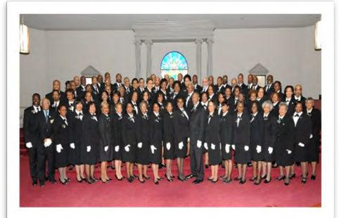
The Senior Usher Ministry