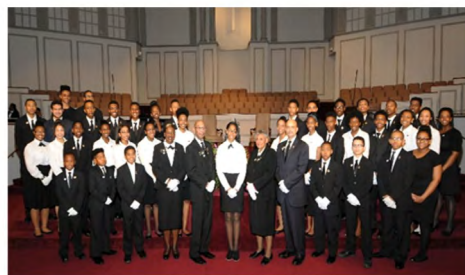
The Junior Usher Ministry