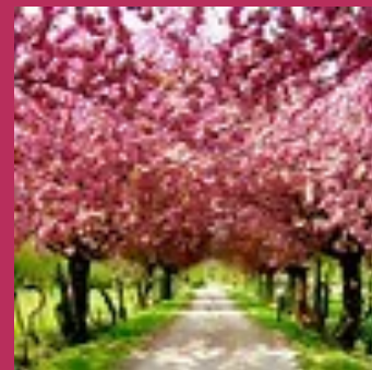
The National Cherry Blossom Festival March 20th—April 17th