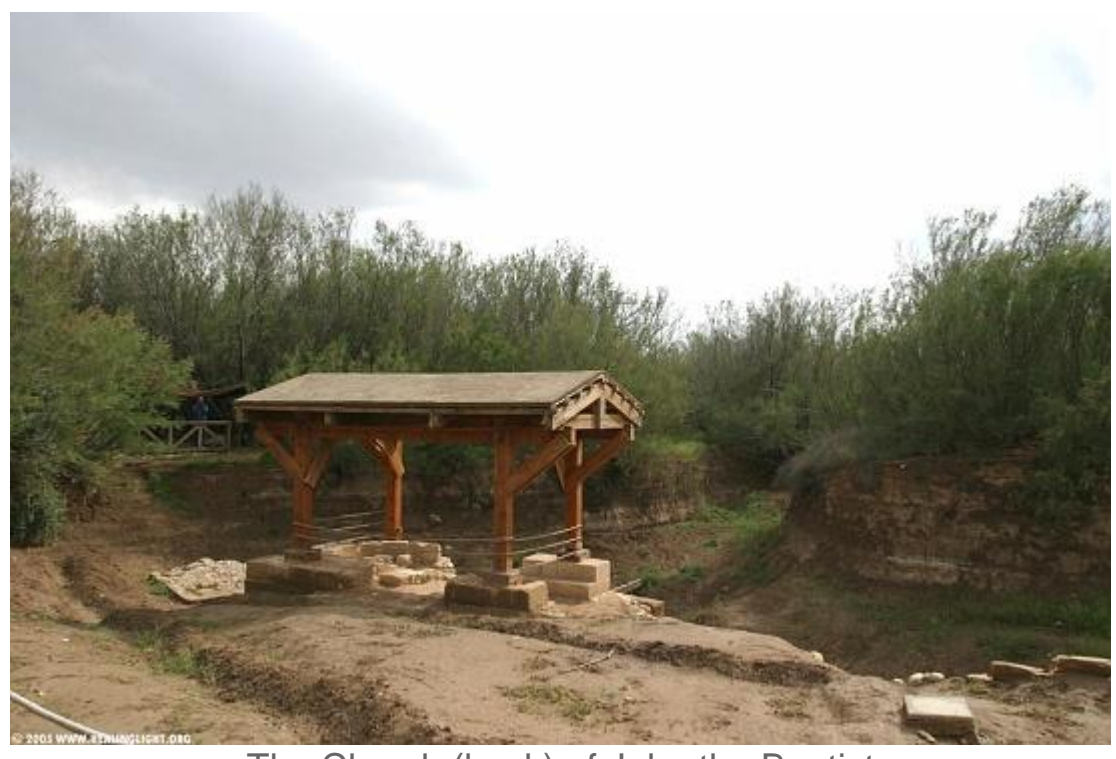
The Church (back) of John the Baptist