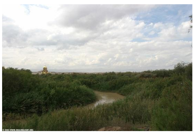
The "jungle of the Jordan" and the now-small Jordan River, with the new Orthodox church in the distance.

The Jordan River today is little more than a low muddy polluted stream. About 90 percent of the river's natural water flow has been diverted by Israel, Jordan, and Syria for domestic and agricultural use, with sewage flowing in its place.