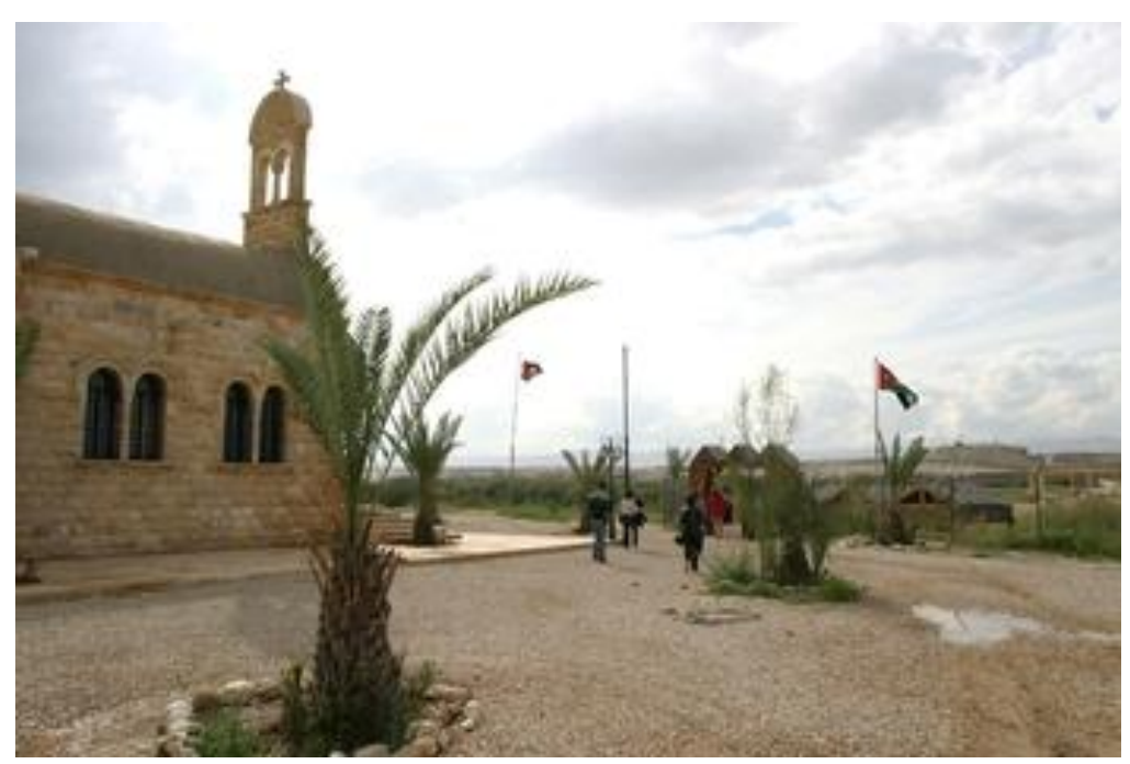
Modern Orthodox Church at Wadi Kharrar.