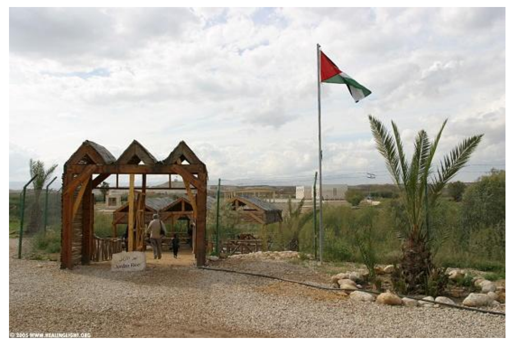
Entrance to the Baptism Site, Wadi Kharrar, at the Jordan River. Note the fences and Israel flag across the river (just left of the palm).