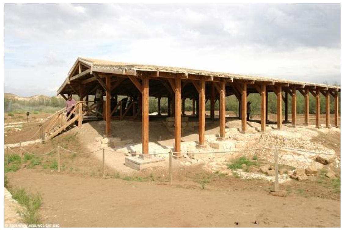
Sheltered ruins of the Church of John the Baptist at Wadi Kharrar