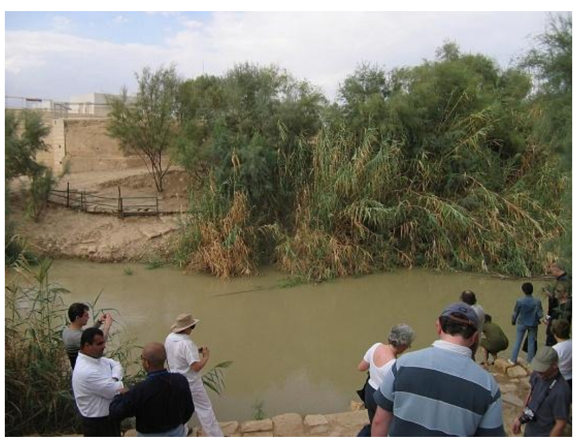
Steps lead down to the Jordan River, where Israel is only a few feet away.