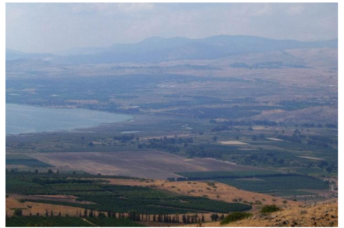
The plains of Bethsaida