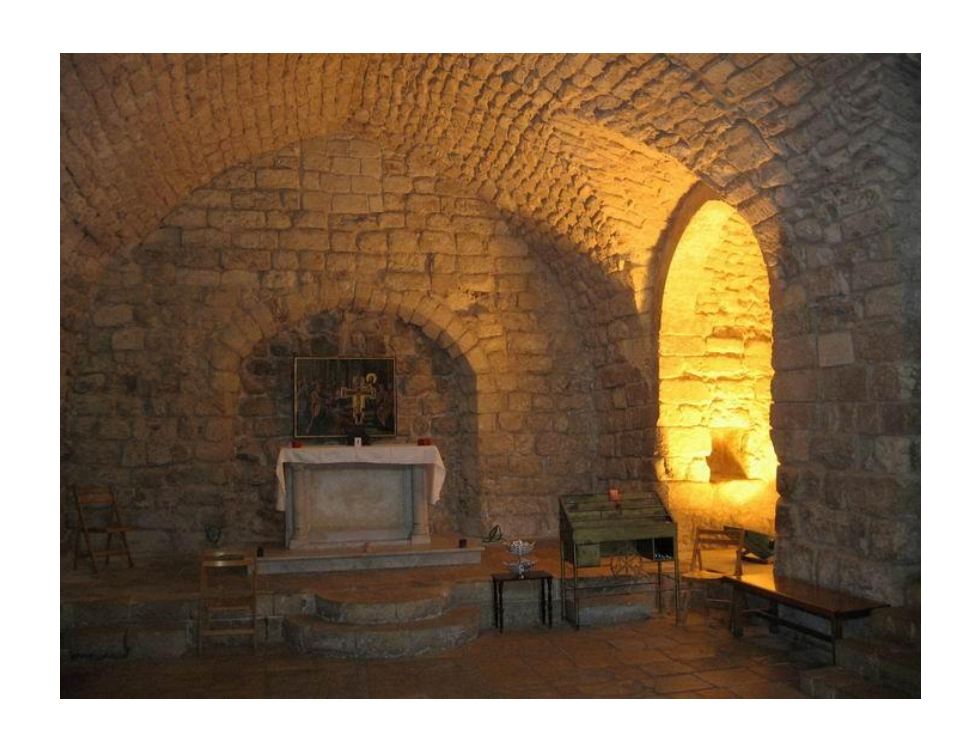
This is a close up of the picture.