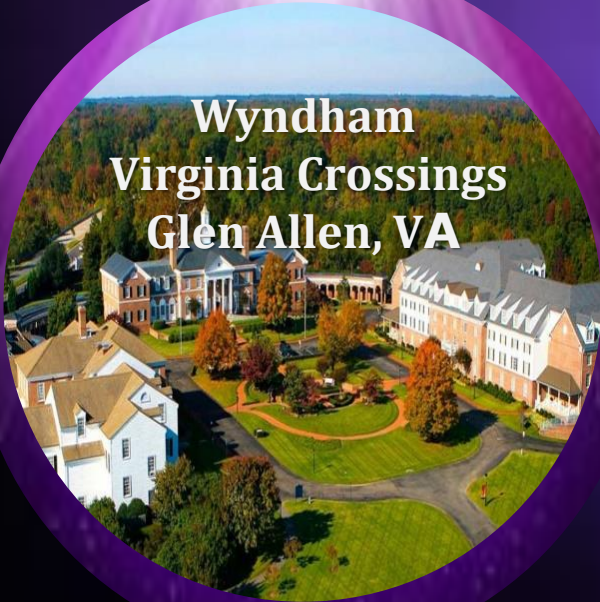
Wyndham Virginia Crossings Glen Allen, VA