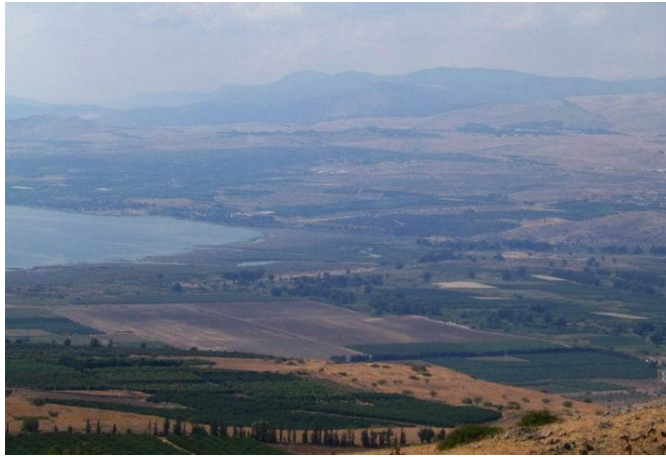
The plains of Bethsaida