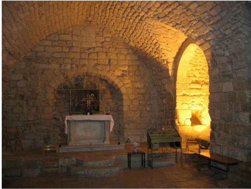
This is a close up of the picture.