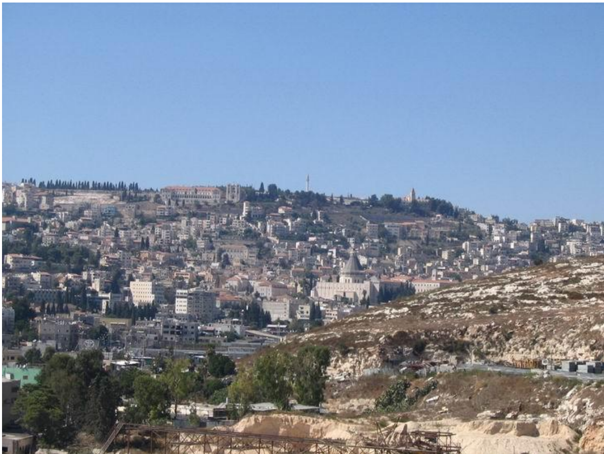
The Modern City of Nazareth

You have now traveled with Jesus 10 miles to Nazareth, his boyhood home. On the Sabbath, he went to the synagogue where he was handed the scroll of the prophet Isaiah to read to the crowd gathered there.